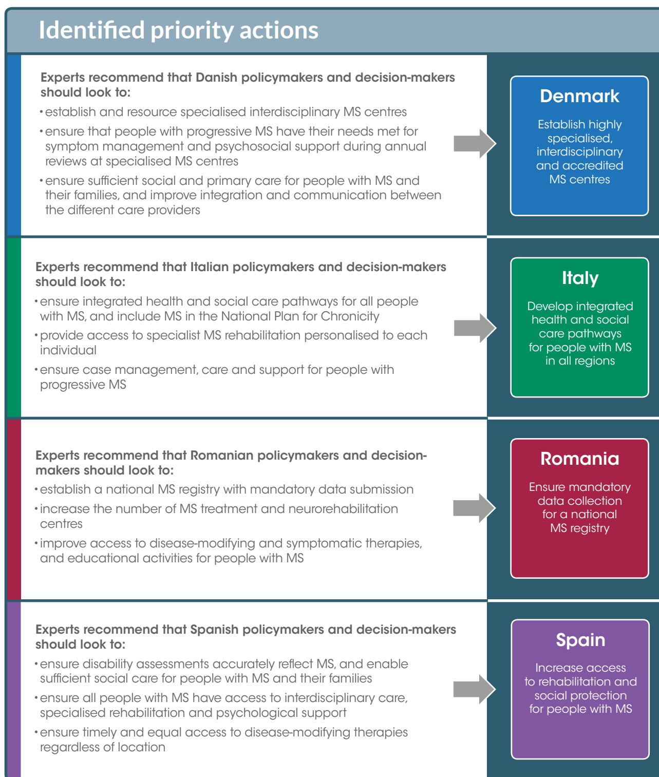
Figure 1. Key priority areas emerging from national stakeholder consultations. For Denmark, recommendations were determined from individual consultations; for Italy, Romania and Spain, these stemmed from round-table meetings.